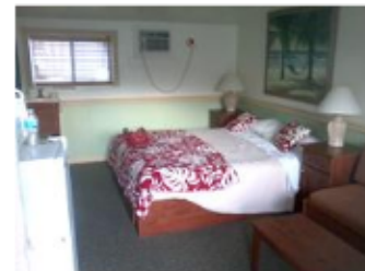
There is a trundle bed under the sofa

Just a few miles south of MCBH Kaneohe, is Bellows Air Force Station. Bellows has brand new condos for $120/night, and 2-3 bedroom beach cottages for $95/night. Another option is the 'rustic cabins' along the beach. They go for $30/night, with a double/queen and a bunk bed, but with a catch: they have no electricity, or linens (I priced sheet sets and pillows at Walmart for about $30). The rustic cabins are near the beach facilities, with a maximum 21 day stay. This beach is one of the best on Oahu, and is just beautiful. The waves are just large enough to body surf. We ate breakfast at the café, located in the main building.