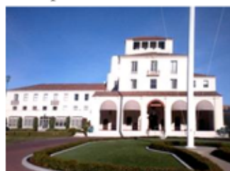
Great old military hotel

I called the Monterey Navy Gateway Inns and Suites (NGIS) and booked us for one night in the main building at $55/night. WOW! This is an historic old hotel, with high ceilings and thick walls. The 'standard room' we were given was approximately 20'X20' , with some old admiral's name on the door. The view of the grounds from our room was spectacular.