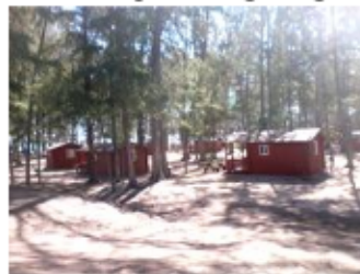
'Rustic cabins' at Bellows

If you are a golf enthusiast (I'm just a caddy), every base on Oahu has at least one golf course. I originally booked a rustic cabin on line for December as a fall back, before the ANG Milwaukee flight popped up, as we were planning on going to Hawaii in December.