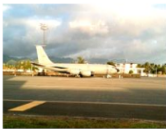
Our KC-135 at Hickam AFB, HI