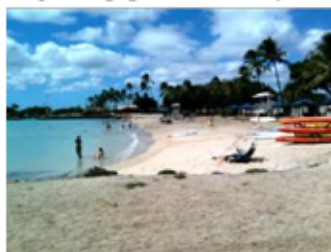
My wife's reading spot at Hickam beach

You will find the Hickam beach and marina are one of many unique places to relax. With little wave action, you might think of it as a beginner's beach. As the ships enter Pearl Harbor, they cross in front of the beach and marina. To the left of the beach, planes of all sizes and nationalities land and take off on the runway that parallels the lagoon, which is next to the Hickam golf course. Watching a pair of F-22 fighters taxiing and then waiting behind a JAL 747 to take off seems strange, but then you get to see and hear those fighters buzzing around the Hickam and Honolulu areas.