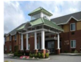
Navy Lodge at Newport, RI