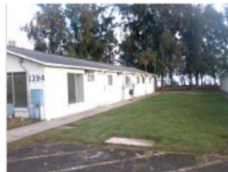
The beach is behind the trees

I knew that could get a cabana cottage at Kaneohe Marine Corps Base for $64 per night (the regular lodging is $132/night, with regular two bedroom beach cottages at $90/night). If you have a car, you can cross the runway (it's pretty cool to see planes landing right in front of you as you may have to wait for them), and get to the cabanas. The Marine Base is on the windward side of the island, and on a peninsula. The cabanas are on a secluded beach on Kaneohe Bay. You get a refrigerator, microwave, coffee pot, TV, and a sink to wash up. The shower and lavatory facilities are shared, if you don't mind (hey, they're beach cottages). We booked in for two nights, hoping to get lodging at Pearl Harbor, or Hickam.