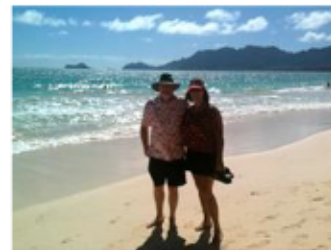
You can't beat this beach or the view