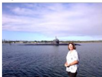
Café lunch with a submarine

It was a strange feeling to get up early and watch the Greenbay Packers beat the Titans at 7am local, while eating a buffet at the Hickam AFB JR Rockers sports bar. Many Air Force Bases have combined casual clubs. The Navy and Marines use the Hickam officer club for special events, with many casual places to dine on both bases, and buffets open to all ranks. As the ships enter Pearl Harbor, they pass right next to the Hickam Officers club and Wright Brothers Café. As you are dining, you might see a missile cruiser, frigate, submarine, or an army cargo ship pass next to you.