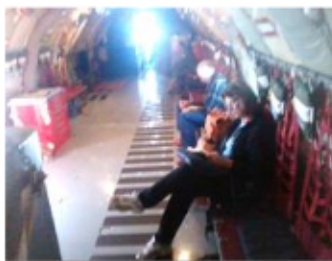
Business Class Seating on KC-135